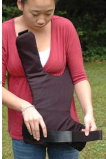
After you put the straps in place, the vest will look like this.

Two straps are 22" long. One is 18" long. Attach one of the 22" straps to the right side of the waist panel of the vest . Overlap the second 22" strap on top of it. Pass the open end of that second 22" strap through the keeper , and fold it back on itself. This is your waist strap length adjustment. Then take the 18" strap and pass it through the keeper . Follow directions to affix to waist panel .